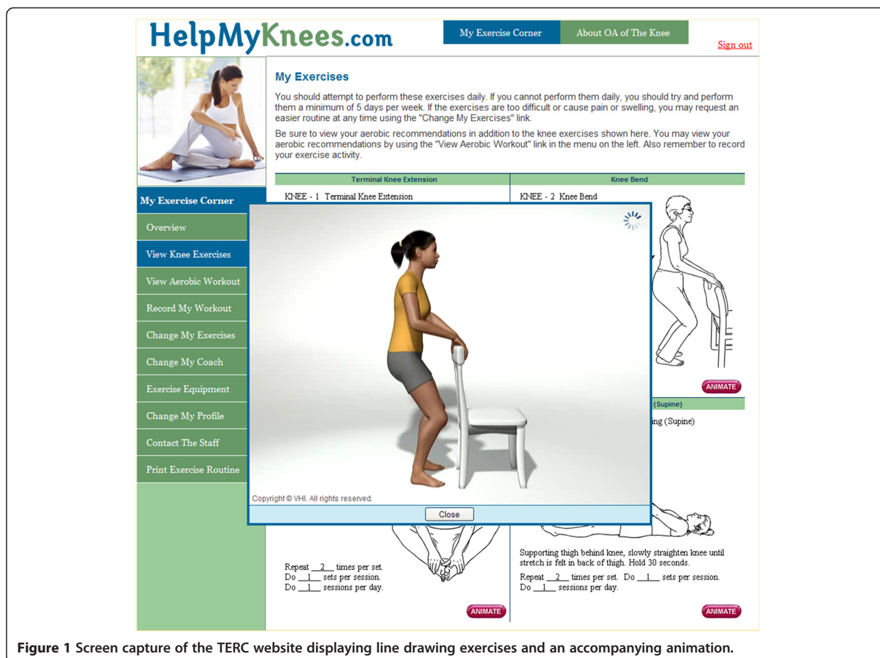
Figure 1 Screen capture of the TERC website displaying line drawing exercises and an accompanying animation.

e.g., Do you have enough energy for everyday life?). Response options were on a 5-point scale (e.g., 1 = not at all, 5 = an extreme amount). A higher score represents better quality of life. Good internal consistency was found in the current study for the physical health and psychological health scales (Cronbach's alphas = .87 and .84, respectively).